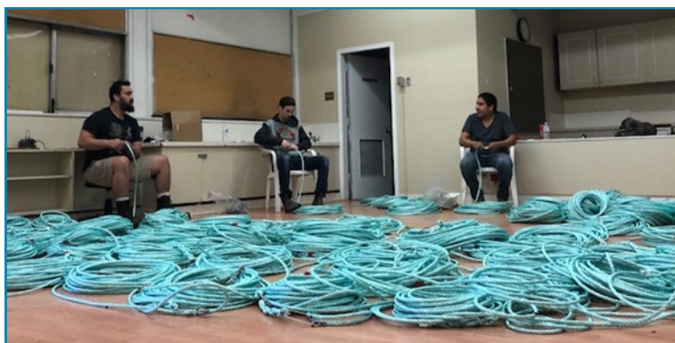
Community members getting the lines ready